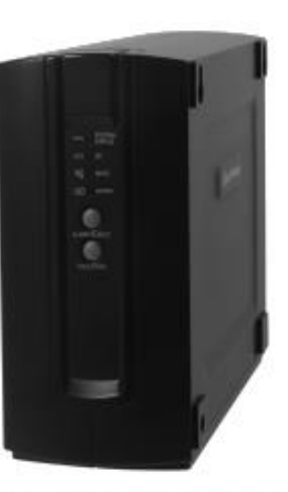
Desktop Battery Backup Unit (DT-BBU)